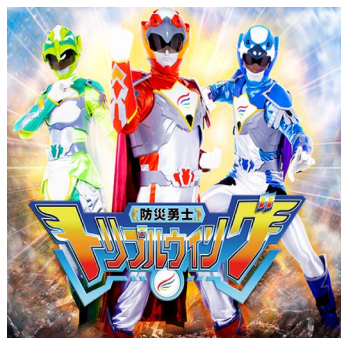
Triple Wings the DR3 Superheroes